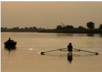
Rowing The Baranja Rowing Club Regatta is held in October in a village called Draž, on the Topoljski dunavac river.

Nature and man live here not only with each other but one for the other. Dario Topić