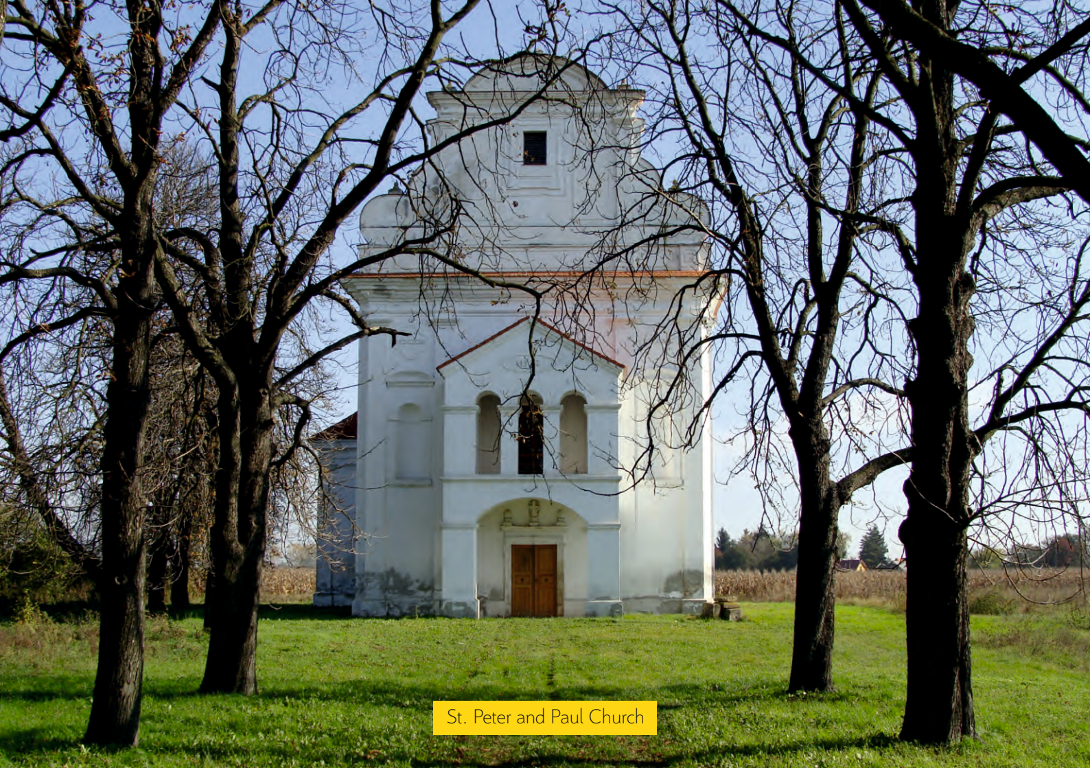
St. Peter and Paul Church