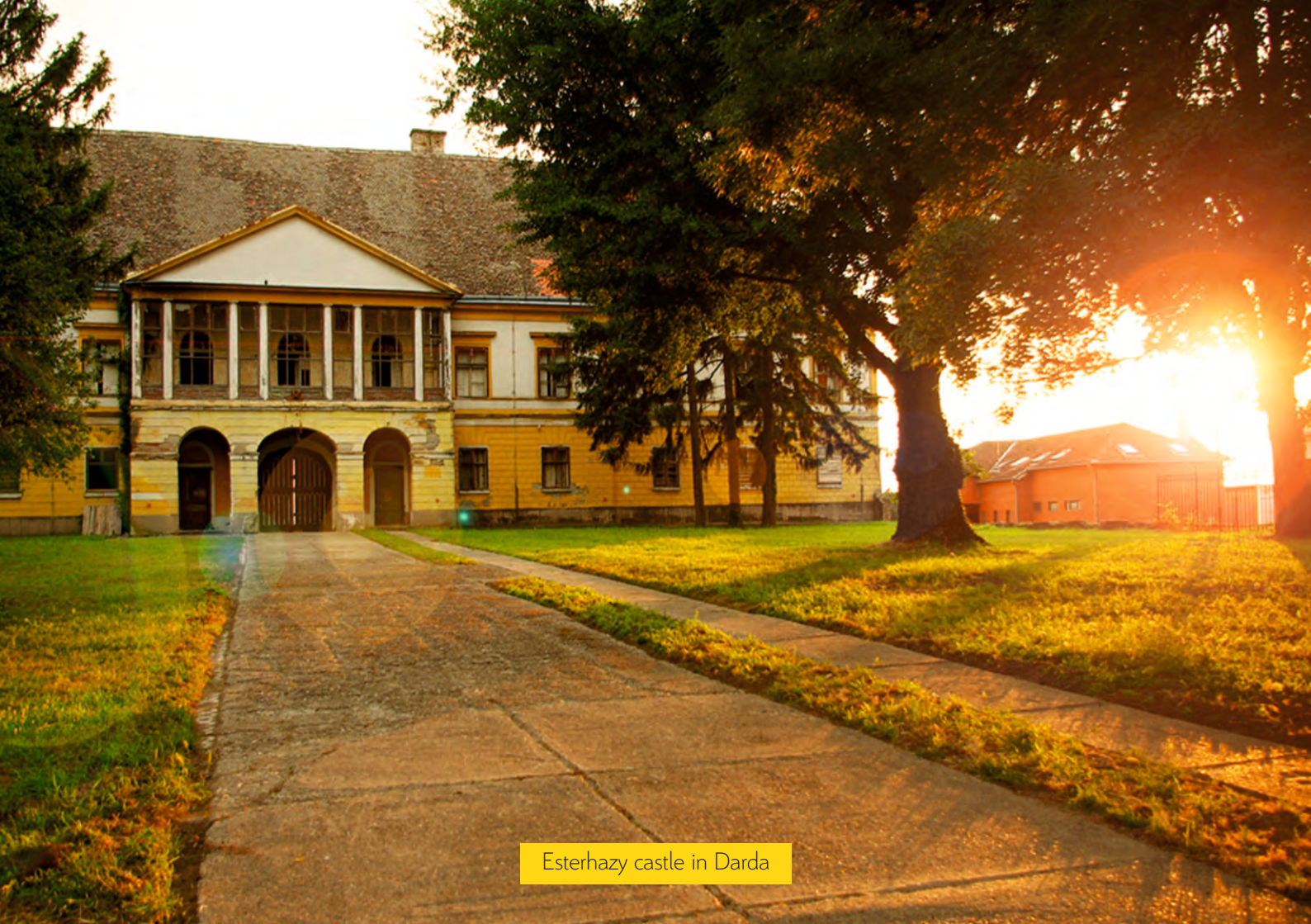
Esterhazy castle in Darda