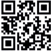
Baranja Tourism board