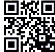
Draž Tourism board