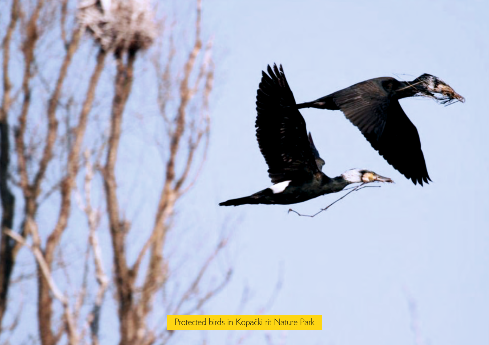
Protected birds in Kopački rit Nature Park