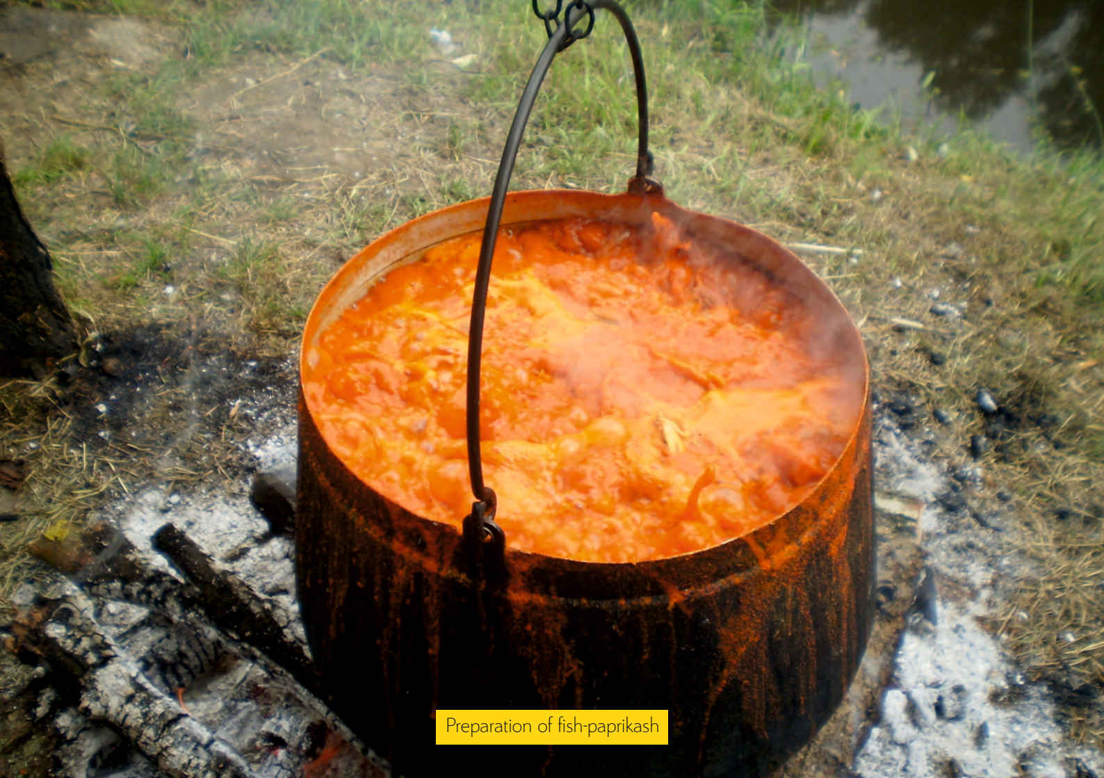
Preparation of fish-paprikash