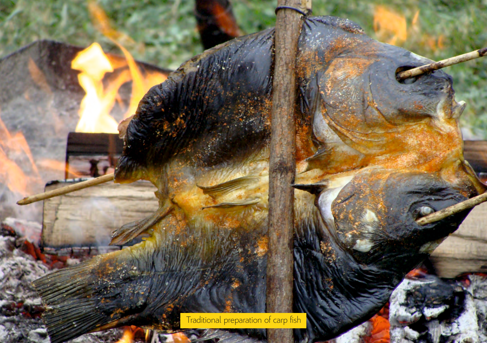
Traditional preparation of carp fish