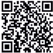
Download Baranja iOS mobile phone app: