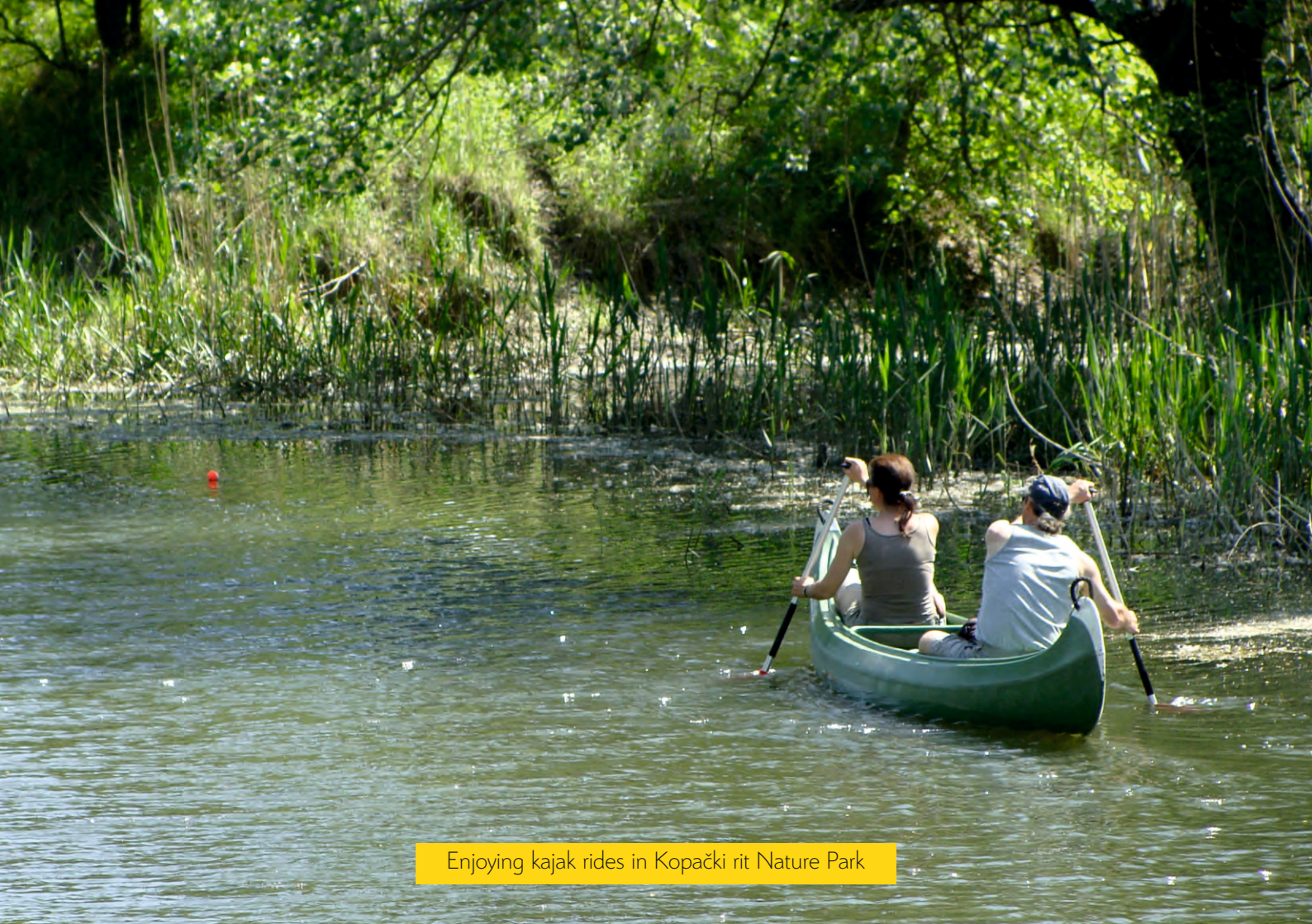
Enjoying kajak rides in Kopački rit Nature Park