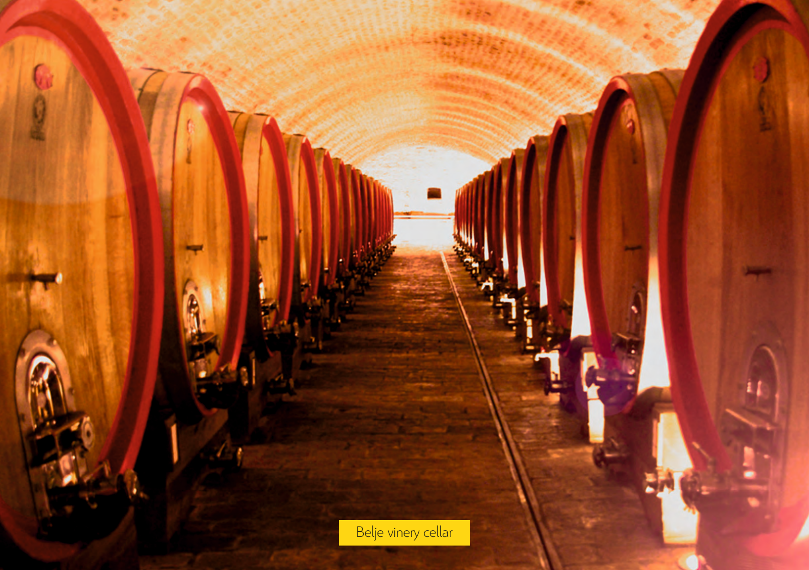
Belje vinery cellar