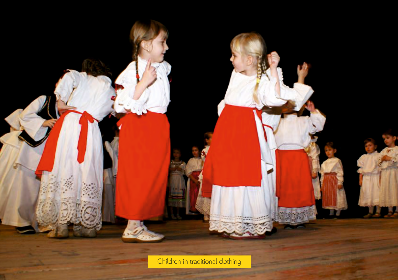
Children in traditional clothing