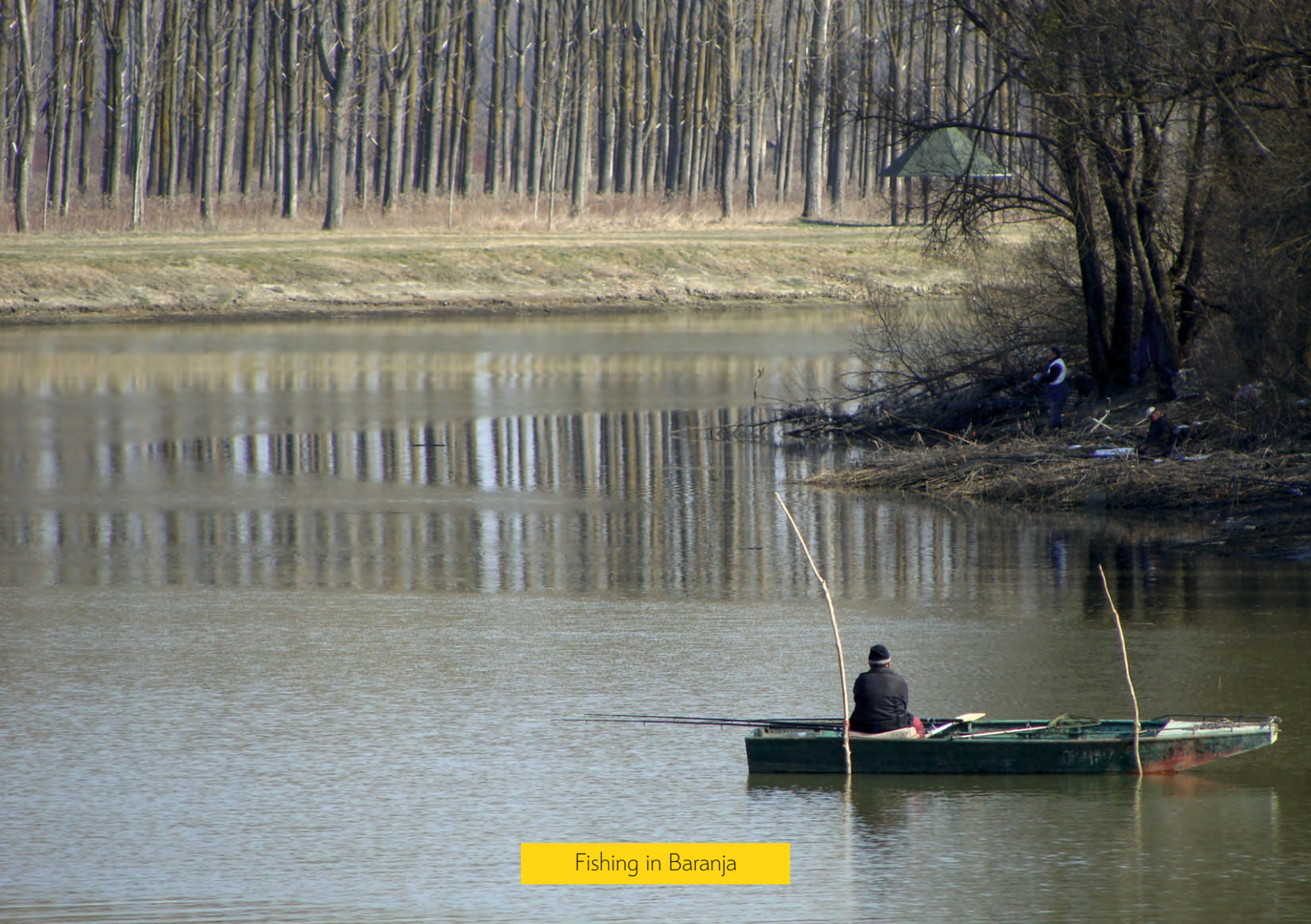
Fishing in Baranja